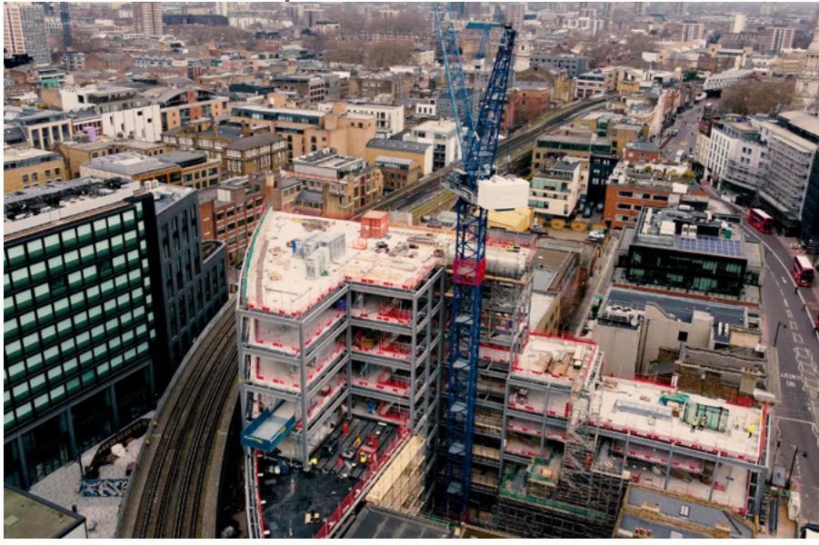
© Timothy Soar © Heyne Tillett Steel

Located in central London, Montacute Yards celebrates the industrial heritage of the area through the creation of a new type of warehouse. Conceived around generous volumes and a legibility of making – from its steel exoskeleton to the finishes within – the project creates two new flexible office and retail buildings with a glazed connection. The refurbishment of a Grade II listed Georgian townhouse and a new two-storey warehouse, complete the development.